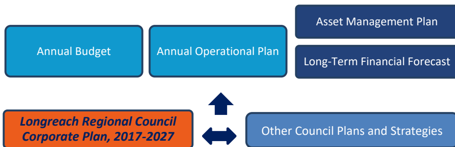
Figure 2 – Longreach Regional Council’s Corporate Plan in Context

The Corporate Plan has an on-going interface at the planning, operational and performance review levels with other Council strategies. These include, for example, Outback Prosperity 2021: Longreach Region Economic Development Strategy and other documents to be prepared including Council’s Community Development Strategy and its Tourism Strategy. These relationships are illustrated below.