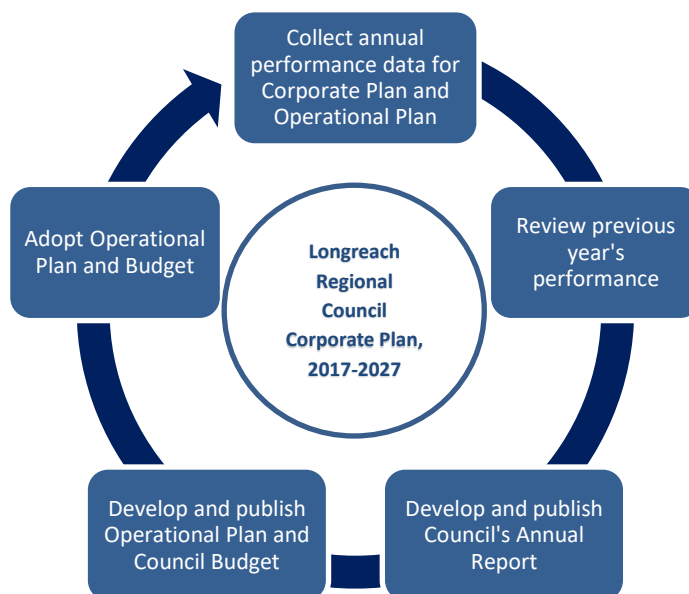
Figure 3 – Annual Planning and Monitoring Framework

In accordance with statutory reporting requirements of the Local Government Act 2009 , and Council’s commitment to engage with the Longreach Region community in setting the agenda for the next ten years, Council will conduct annual reviews of the Corporate Plan. Annual operational reporting will track progress and will assist in the development of the following year’s operational plan and budget.